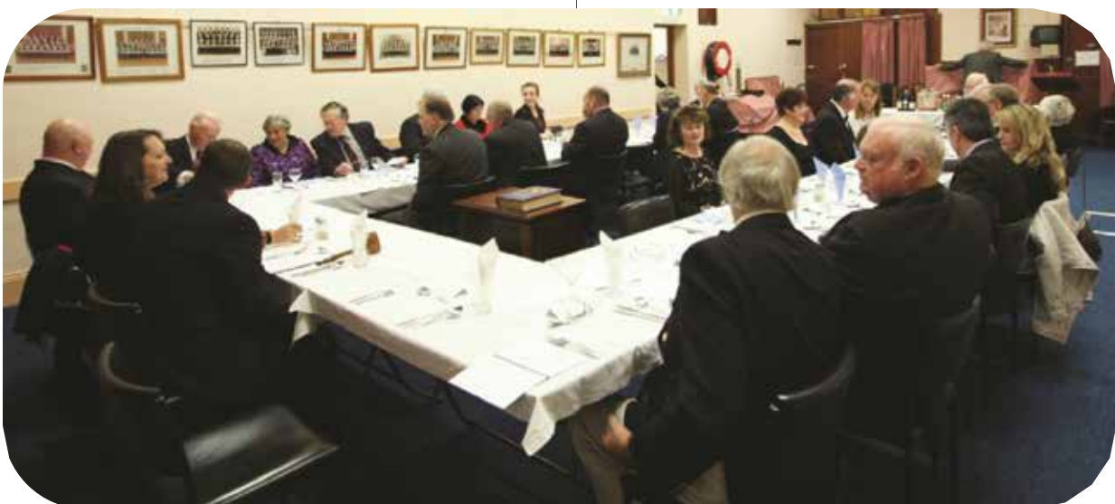
Brethren and visitors at the Table Lodge dinner meeting