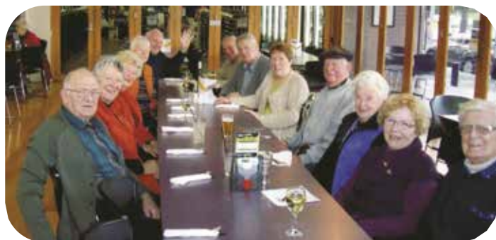
Masons and Mates enjoying each other 's company at Olive's Restaurant

14 Gregory Street Sandy Bay Tasmania 7005 Tel: (03) 6223 5822 Fax: (03) 6224 9812